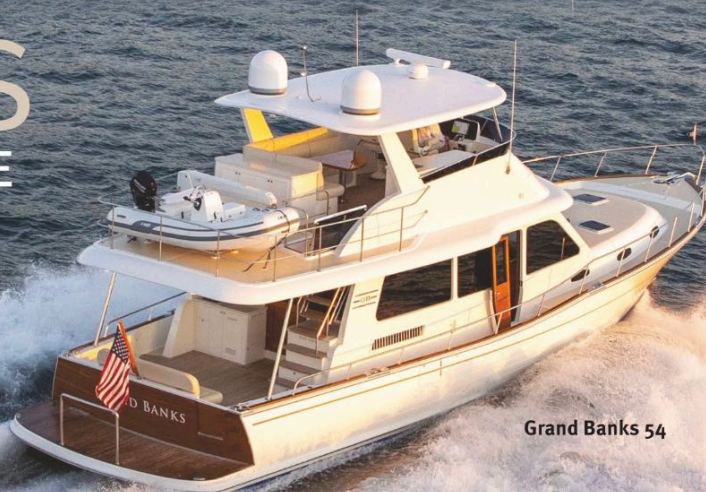
Grand Banks 54