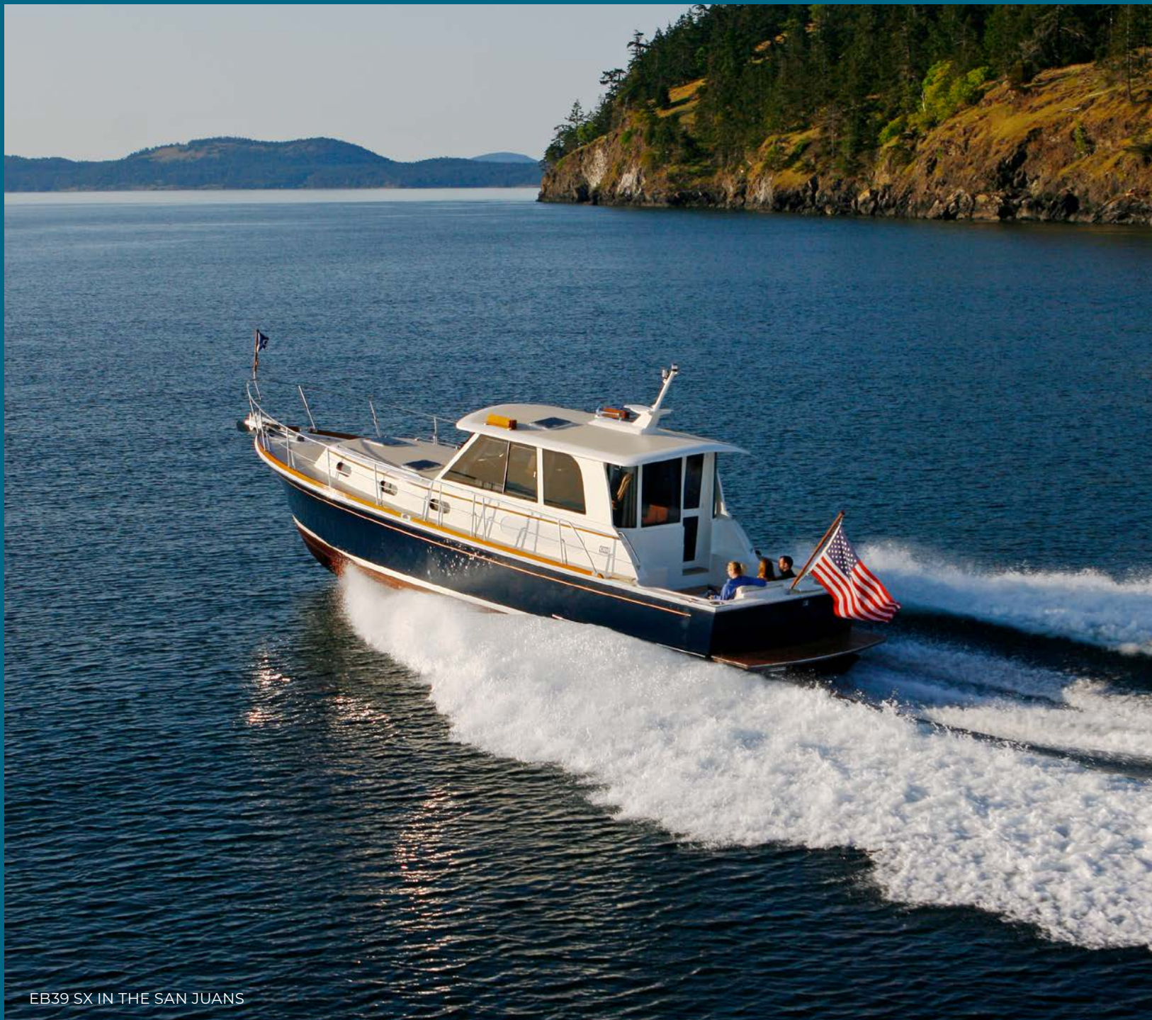
EB39 SX IN THE SAN JUANS